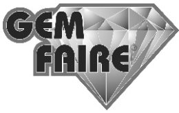
EXHIBIT SPACE CONTRACT SAN DIEGO, CA

Scottish Rite Event Center 1895 Camino del Rio S. (Zip: 92108)